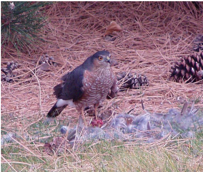
Sharp-Shinned Hawk (taken in April on Airport Way)

With flowers and new green everywhere, it is a fine time to walk the shoreline. You might bring the camera, water, and picnic lunch. There are two access paths from Lakeside Way. Look for the little brown signs, visible from the street. There are two more paths south of the boat launch: one off Edgewater, and one off Washington Place. Please respect the property of shoreline residents.