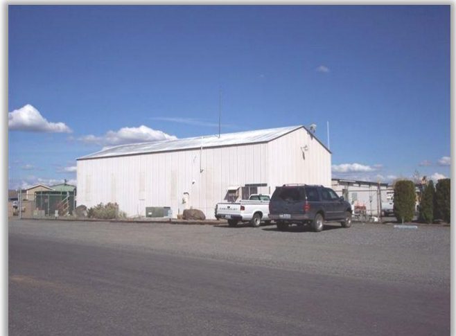
BEFORE CONSTRUCTION STARTED

The maintenance facility expansion and remodel is coming along extremely well at this point.